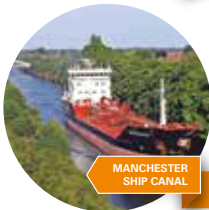
MANCHESTER SHIP CANAL