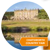
CHATSWORTH COUNTRY FAIR