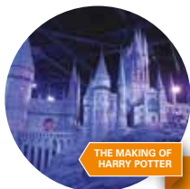
THE MAKING OF HARRY POTTER